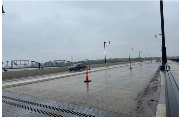
Traffic patterns will shift to the inside lanes so installation of traffic classifiers can continue. (May 2025)