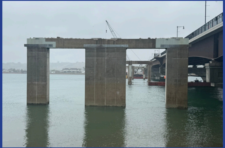
Despite rainy conditions, crews continue demolition of the existing bridge piers. (May 2025)