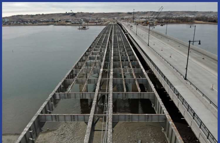
Old bridge deck demolition. Dec. 2024