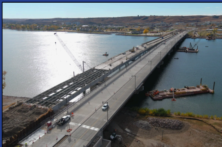
Project overview from the Pierre side. Nov. 5, 2024.