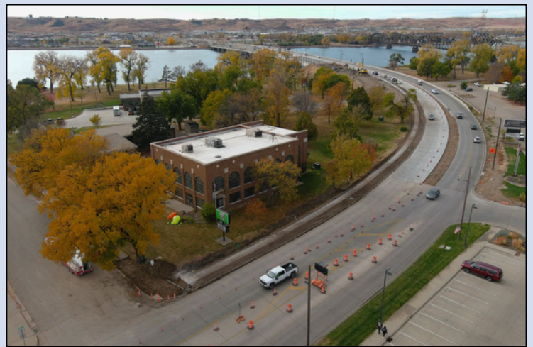
Sidewalk extending from the new bridge to James Street in Pierre. Nov. 5, 2024.