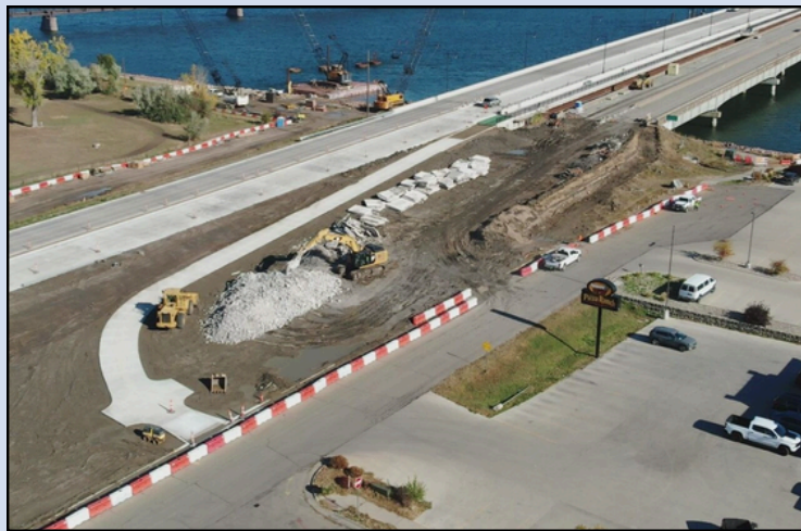
Pedestrian ramp installation at Hustan Avenue. Nov. 4, 2024.