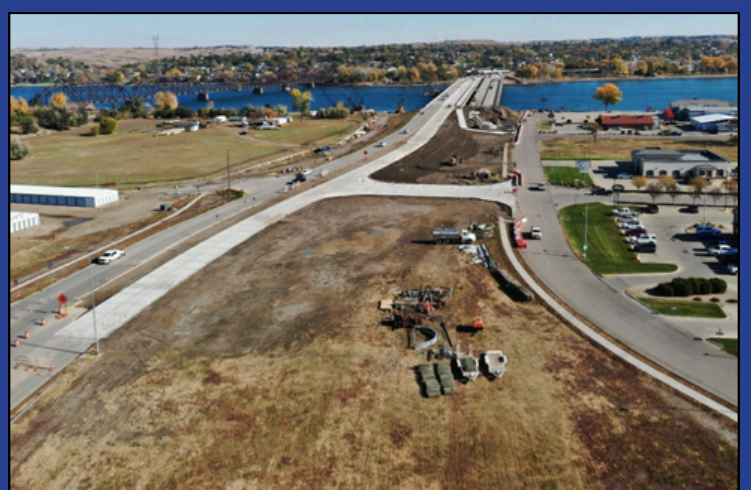
Project overview from the Fort Pierre side. Nov. 4, 2024.