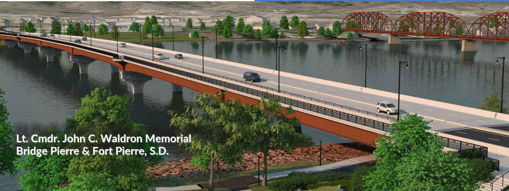
Lt. Cmdr. John C. Waldron Memorial Bridge Pierre & Fort Pierre, S.D.