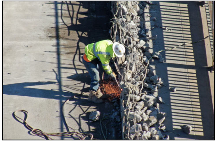
Crew works to disassemble components of the existing bridge. Nov. 4, 2024.