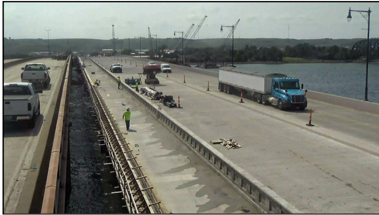
Freight moving successfully across the new bridge as crews work on the bridge deck, Aug. 07, 2024.