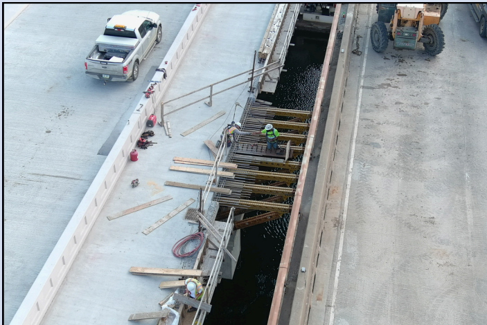
Belvedere formwork installation, Aug. 12, 2024.