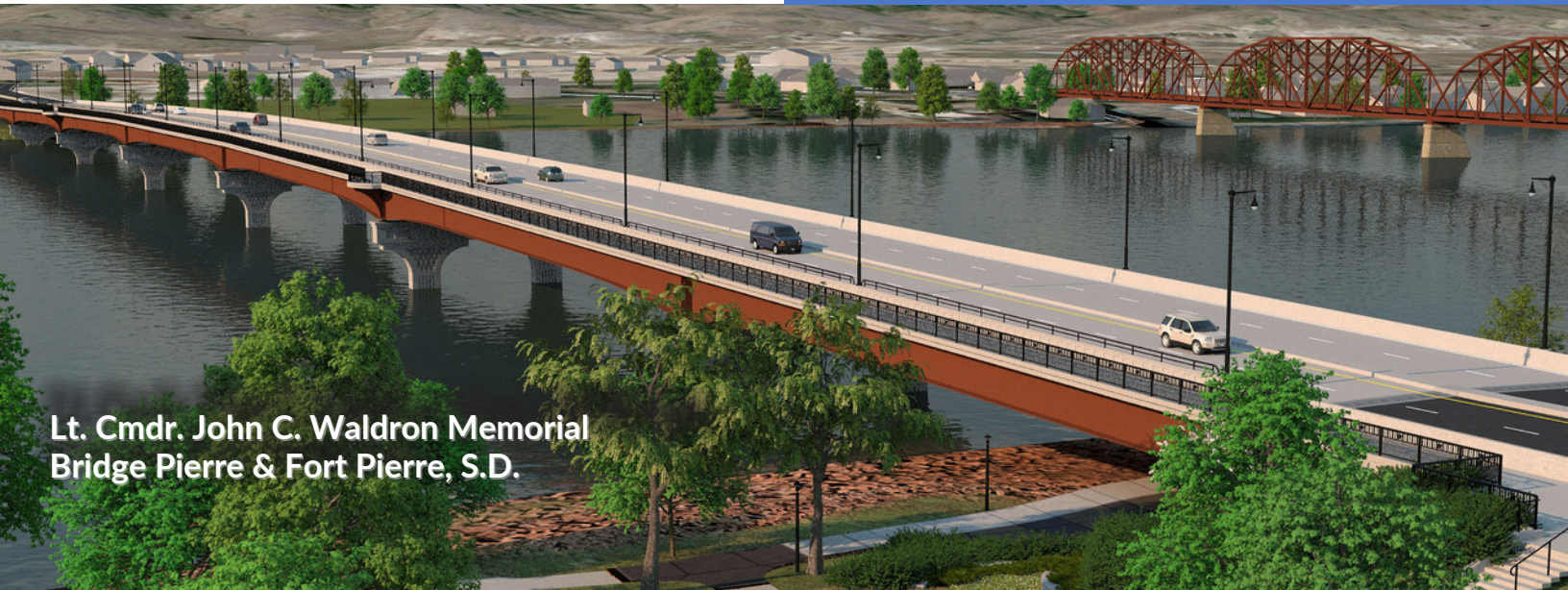
Lt. Cmdr. John C. Waldron Memorial Bridge Pierre & Fort Pierre, S.D.