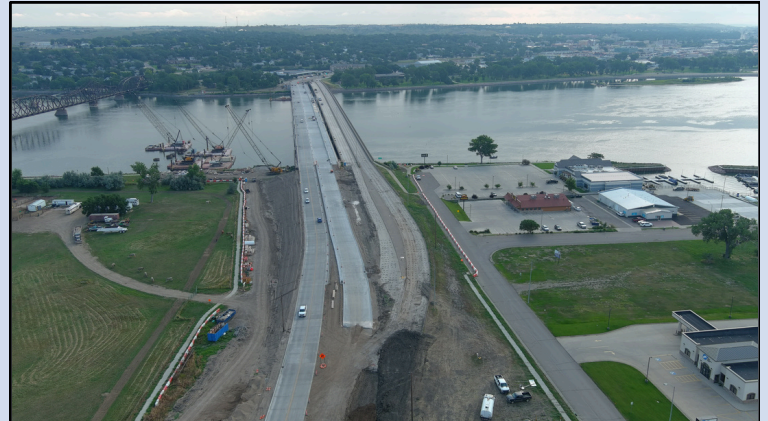
New approach slabs, earthwork, and reconfiguration on the Ft. Pierre side, Aug. 12, 2024.

Keep up to date on photos, videos, and construction progress by visiting https://www.Pierre-FtPierreBridge.com .