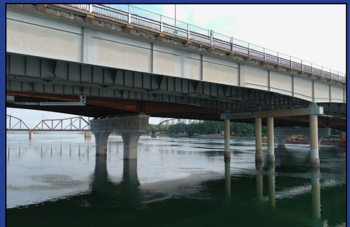
Existing bridge columns, capitals, and bent caps alongside new bridge versions, Aug. 12, 2024.