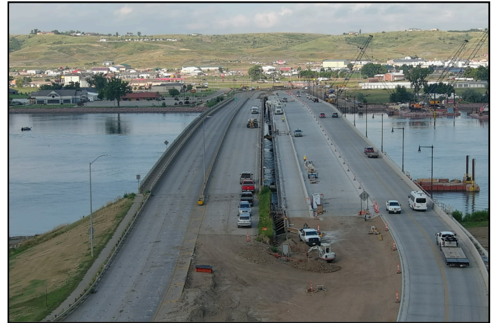
Traffic flows through the westbound lane as crews operate in the eastbound lane, Aug. 12, 2024.