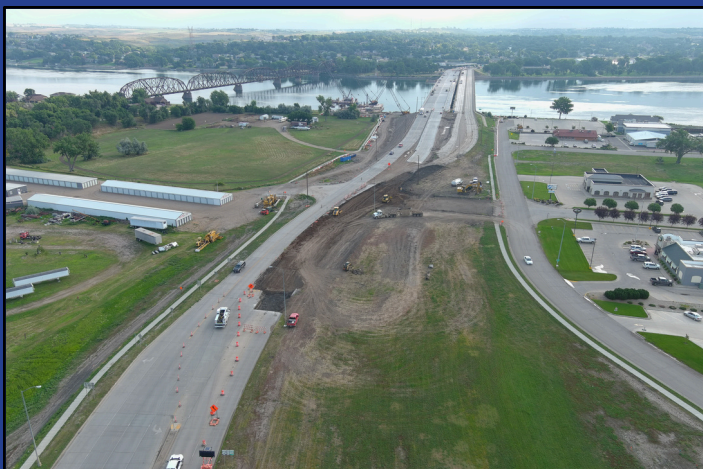
Island Drive reconfiguration progressing alongside approach work on the Ft. Pierre side, Aug. 12, 2024.