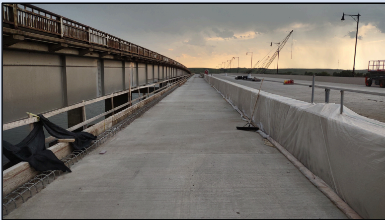
A future pedestrian's perspective from the new bridge deck, July 29, 2024.