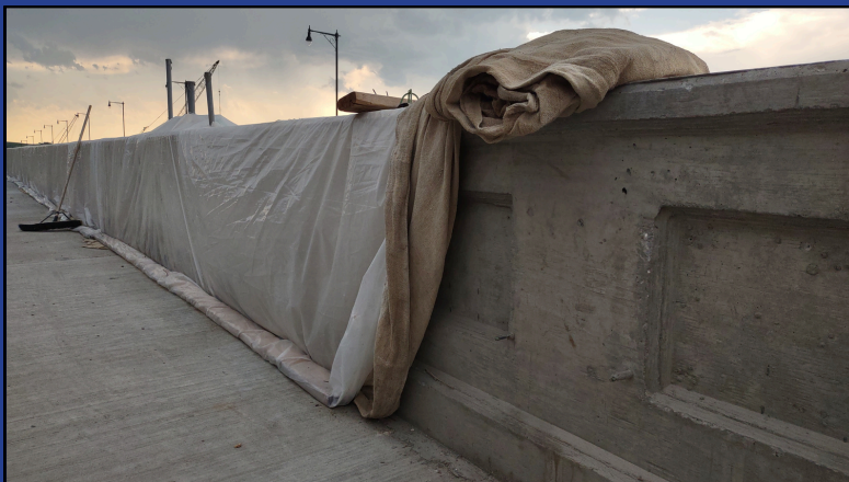
A sneak peek of the new pedestrian separation rail, July 29, 2024.