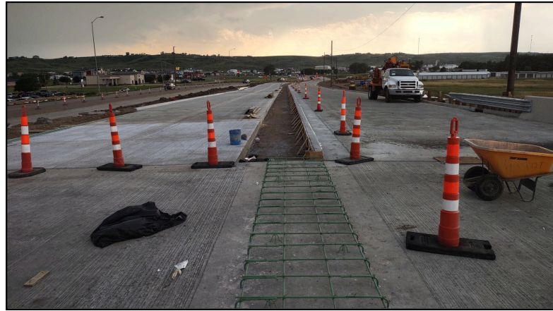
Median curb form meets the new approach slabs on the Ft. Pierre side, July 29, 2024.