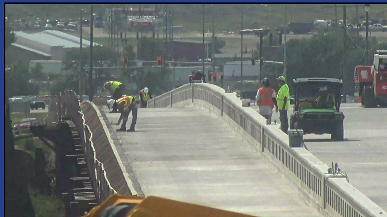
Workers completing concrete formwork for upcoming pedestrian curb, July 30, 2024.