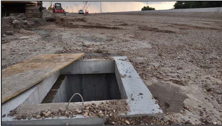
New drop inlet on the Pierre side, July 29, 2024.