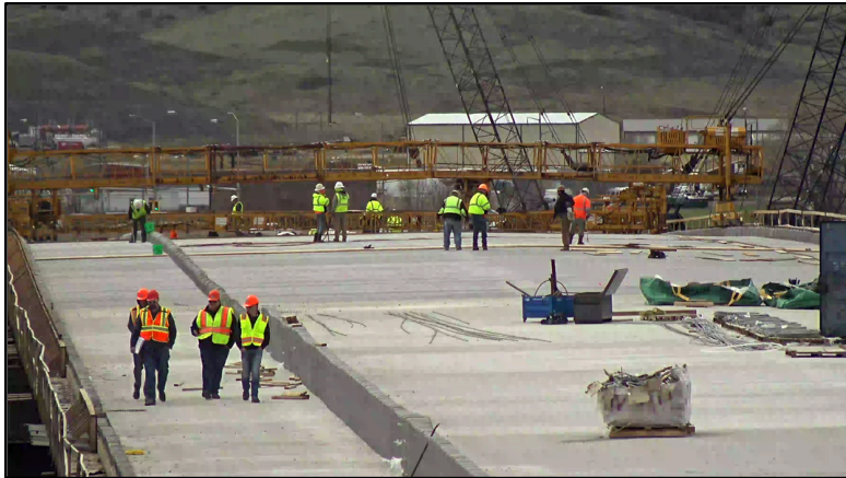
Workers and inspectors prepare for upcoming barrier rail and deck concrete work, April 17, 2024.