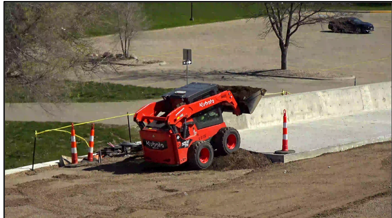
A worker uses a skid steer to grade a connecting area between concrete slabs, April 23, 2024.