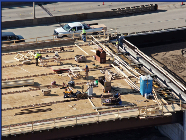
Workers complete the final deck and overhang formwork for concrete, April 23, 2024.