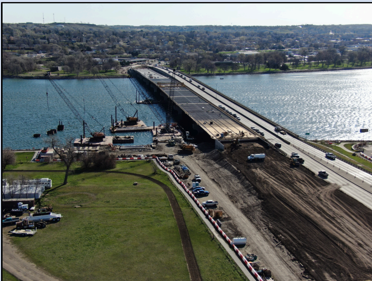
Approach grading on the Ft. Pierre side, April 23, 2024.