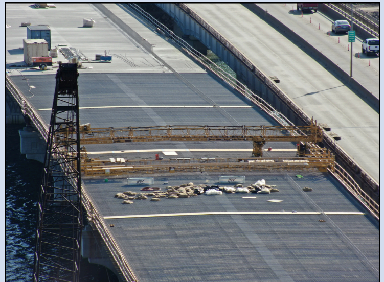
Reinforced steel rebar in place for the next deck pour, April 23, 2024.