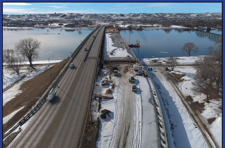
Eastern approach, Pierre side, Jan. 30, 2024.