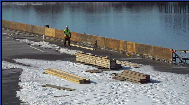
Railing forms on the new bridge's north side, Jan. 30, 2024.