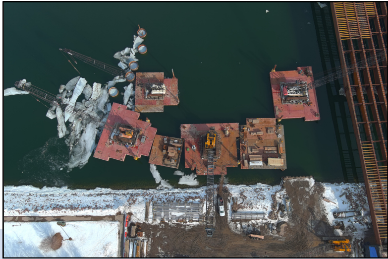
Overhead view of barge cranes and river ice barrier, Jan. 30, 2024.