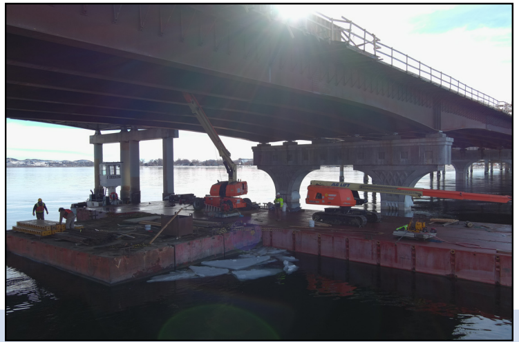
Barges support forklifts during superstud relocation, Jan. 30, 2024.