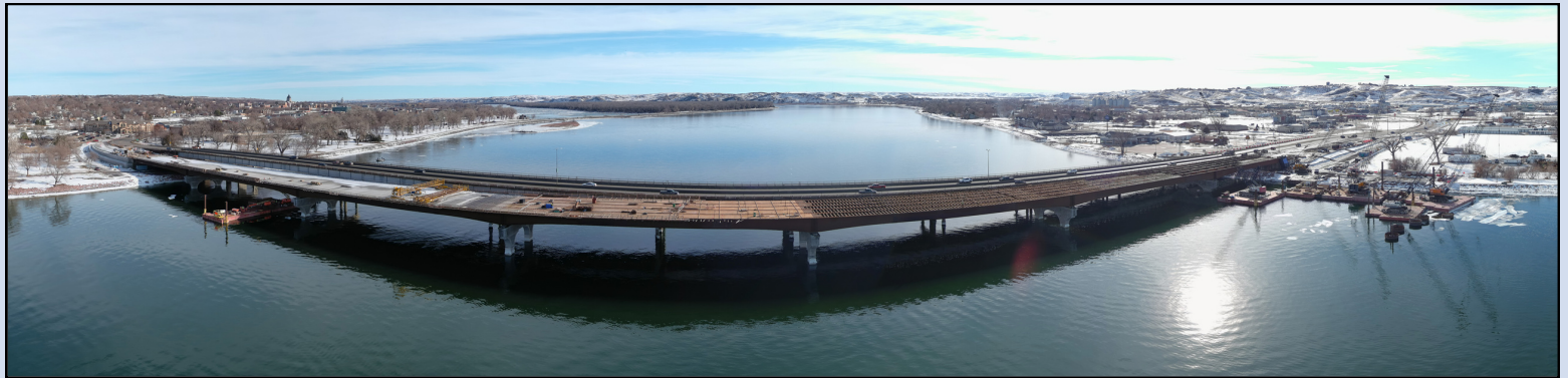
Panoramic view from the north side of the new bridge, Jan. 30, 2024.