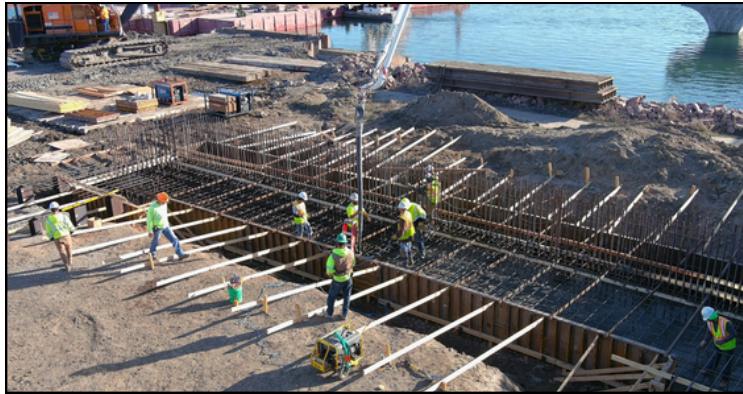
Ft. Pierre abutment, April 2023.