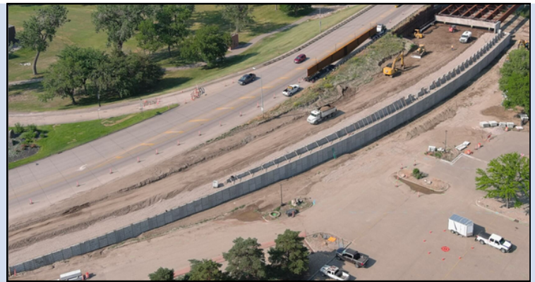
Pierre MSE Wall, June 2023.