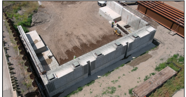
Ft. Pierre abutment, Aug. 2023.