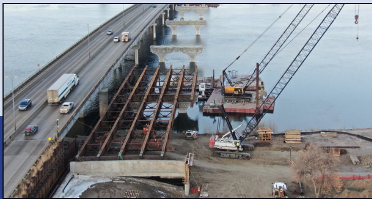
Pierre-side girder lines, March 2023.