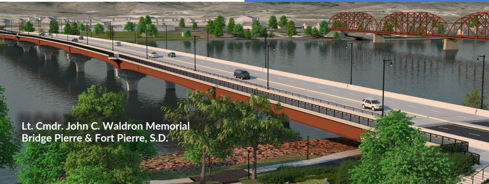
Lt. Cmdr. John C. Waldron Memorial Bridge Pierre & Fort Pierre, S.D.