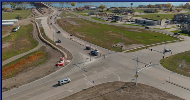
U.S. Highway 14/U.S. Highway 83 intersection, Sep. 2023.