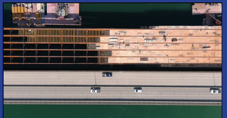
Superstuds, joists, plywood, and reinforcements, Sep. 2023.