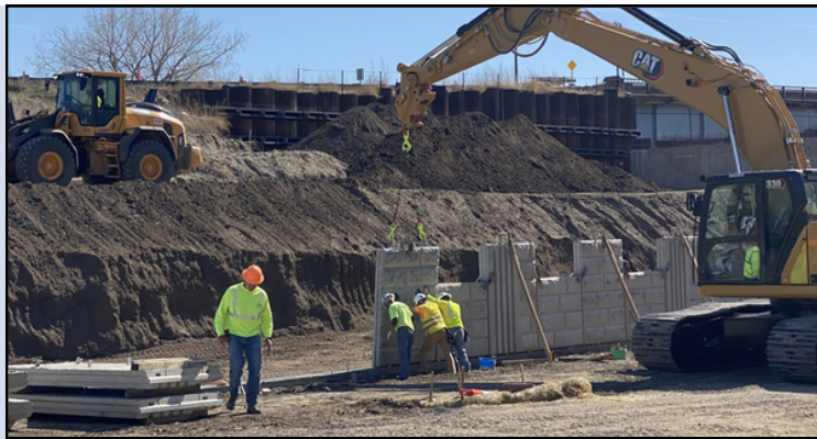
Pierre MSE Wall, May 2023.