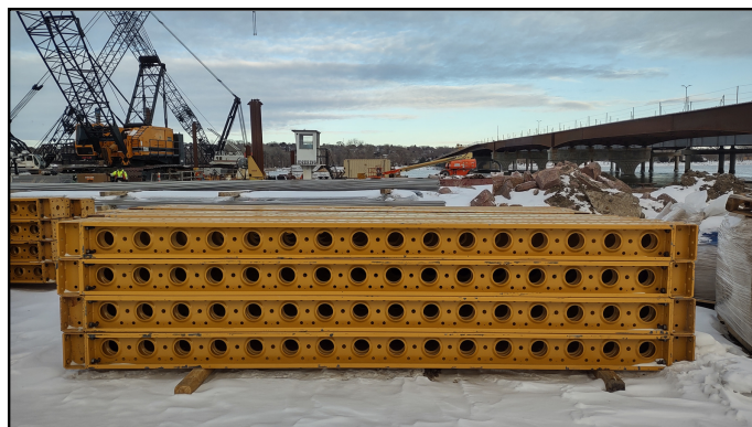
New superstuds staged near the barge area on the Ft. Pierre side, Jan. 16, 2024.