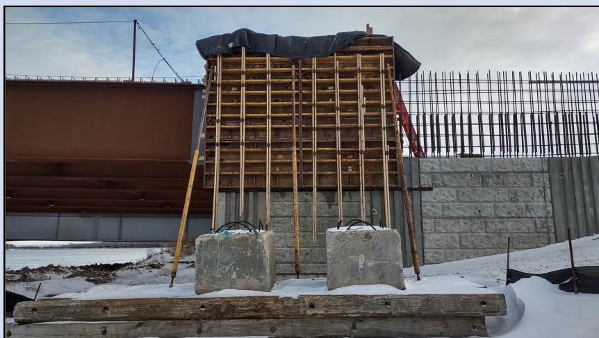
Framing supports the recently placed concrete abutment form, Jan. 16, 2024.