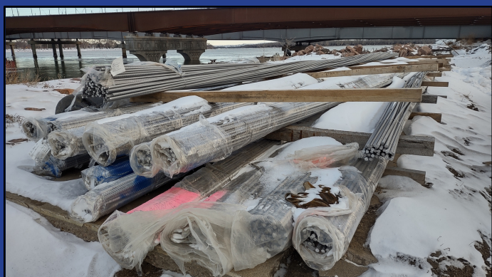
Rebar staged near the barge area on the Ft. Pierre side, Jan. 16, 2024.