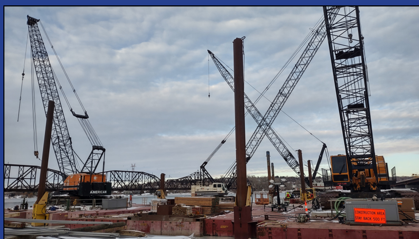
Workers on a barge crane, Jan. 16, 2024.