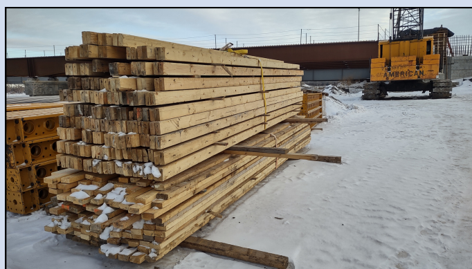
Lumber staged near the barge area on the Ft. Pierre side, Jan. 16, 2024.