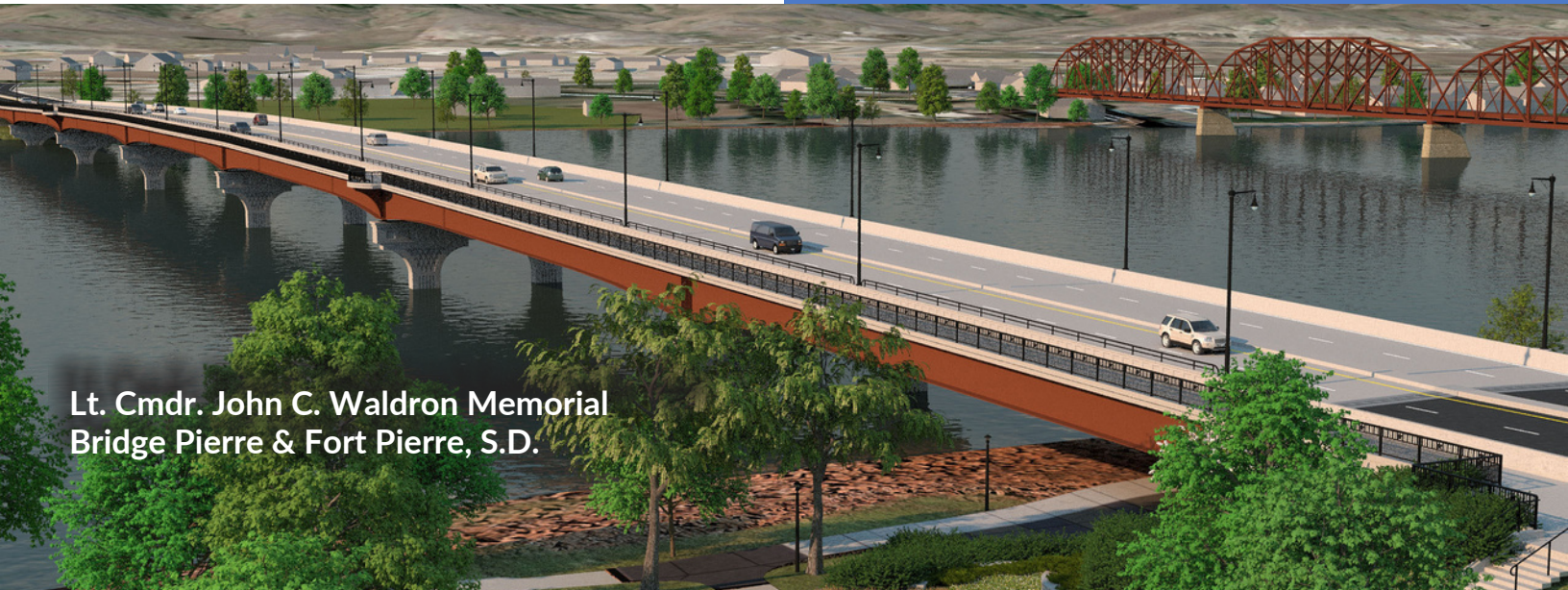
Lt. Cmdr. John C. Waldron Memorial Bridge Pierre & Fort Pierre, S.D.