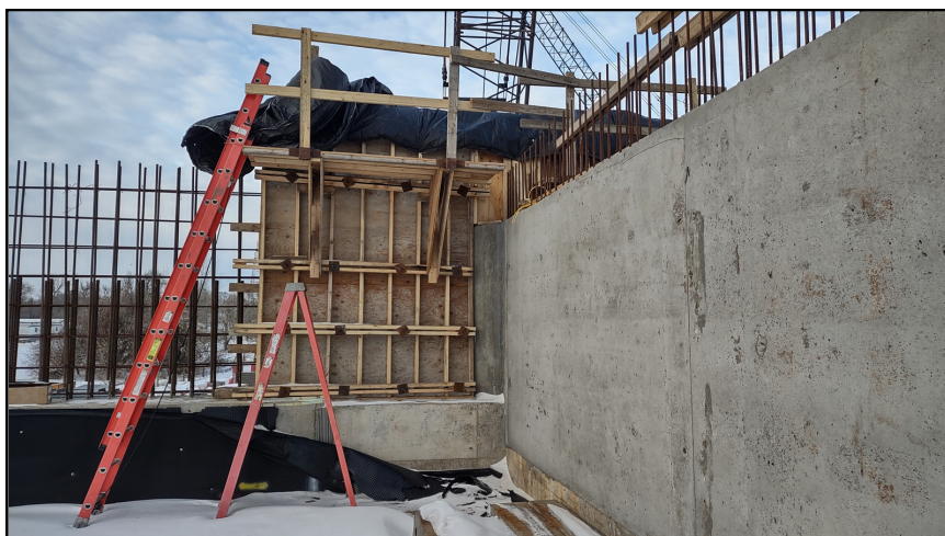
Temporary scaffolding above the Ft. Pierre abutment, Jan. 16, 2024.